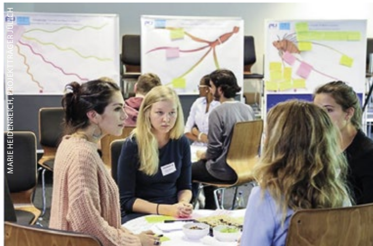
Participants of the PtJ-BONUS workshop 'Knowledge Transfer in Marine Science' at the 9th YOUMARES conference in Oldenburg, Germany.

■ The keywords 'science communication', 'application of scientific results' and 'proactive behaviour' dominated the discussions of the PtJ-BONUS workshop during the 9th YOUMARES conference on 13 September 2018 in Oldenburg. An intense World Café session highlighted the opportunities and limitations of knowledge transfer. Furthermore, the participants considered the enormous impact that can be achieved by having research results strategically transferred to non-expert communities. Also the support of open access as an important fundament to foster the exchange within the scientific community was widely discussed. Further, the workshop participants were convinced that the transfer of information has to go hand in hand with a certain degree of 'entertainment value', which is crucial to communicate the central message of 'Research is fun'. All